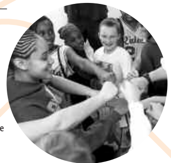
Future members of the Inner Circle

Look for THE HEART OF THE GAME coming to a theater near you this summer.