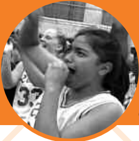
Cheering the team to victory